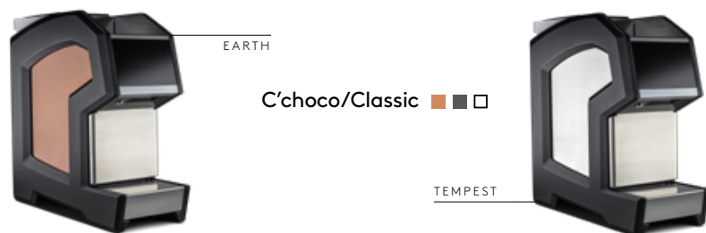
C'choco/Classic ■ ■ □